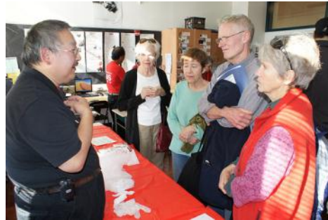
Residents listen to advice from an American Red Cross of the Bay Area Volunteer at the Disaster Preparedness Workshops in Berkeley on October 22, 2011.