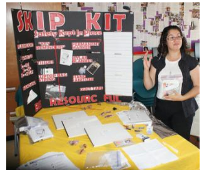
Learning how to make a kit.