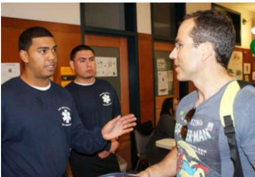
A Bay EMT youth directs a resident to a workshop