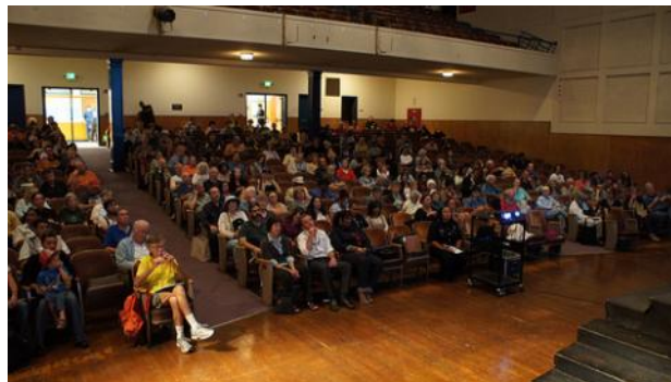
Over 250 residents packed the King Middle School auditorium.