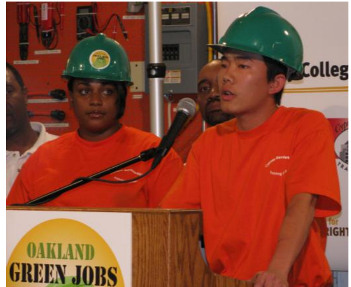
Participants in the Oakland Green Jobs Corps speak about their experiences at a press conference.