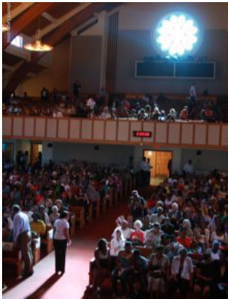
The audience at Beebe