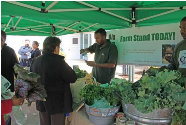
A customer buys vegetables from an employee at the Dig Deep Farms & Produce stand at the Alameda County Administration building in Oakland.

The new Farm Stand operates on Tuesdays from 10 a.m. to 2 p.m. and is located on the plaza in front of the County Administration Building at 1221 Oak Street in Oakland.